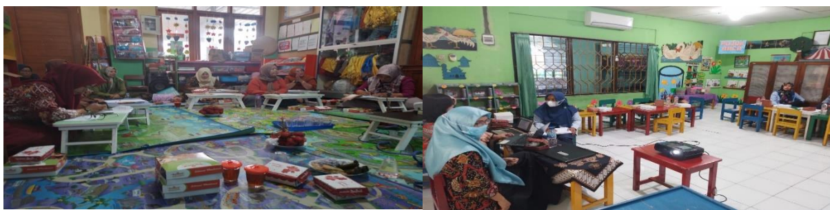
Figure 3. Assistance Activities for Strategy Development and Learning Media for STEAM LOOSE PART

Assistance in the development of learning strategies for the Steam model with loose parts media has no problems and is going according to plan. This mentoring activity is the teacher's job to provide loose part media taken from the surrounding environment. The tools used are according to the theme that will be given to the teacher of each class. Each teacher prepares the tools and materials that will be used to implement learning with the Steam model with loose parts media with different themes. The technique for implementing mentoring is to assist teachers in implementing learning in their respective classes. Participants enjoyed participating in this activity, apart from imparting skills to teachers, this activity also sharpened teachers' creativity in creating Steam learning media with loose parts media using used goods. Mentoring activities are carried out for one month every week one mentoring. The following is a photo of the mentoring activities in this workshop: