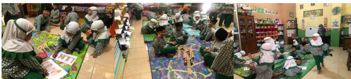
Figure 4. Implementation of Learning Strategies and Learning Media of the Steam Model with Loose Part Media

Implementation is carried out after the debriefing and mentoring activities are over. Implementation activities, namely the application of learning media development strategies along with the use of media that have been designed during the workshop. Implementation activities are carried out in each class of trainees for three days. This is intended to determine the level of understanding and skills in implementing learning strategies after attending the workshop. The following is a photo of the implementation of learning strategies and media in the classroom: