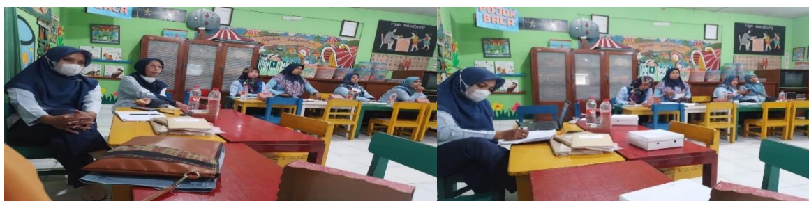
Figure 2. Debriefing Activities

The workshop activity with the development of STEAM model learning media with Loose Parts media at RA Ma'arif Candra Yogyakarta Kindergarten was carried out well. The training at this workshop aims to provide knowledge of developing learning strategies for the Steam model with Loose Parts Media for Kindergarten teachers at RA Maarif Candran Godean Yogyakarta Kindergarten. The debriefing activities are carried out for two months with once a week the teachers communicate with the service team regarding the work shop that has been implemented, the teacher is given the opportunity to ask questions regarding Steam material and loose part material. The first meeting discussed STEAM material and loose parts media. As for the second meeting, the servant provided material related to strategies for making learning media with the Steam model with loose part media to develop student creativity. This debriefing activity was attended by 11 teachers with great enthusiasm. This was seen during the question and answer session between the servant and the workshop participants. The following are photos during the debriefing activities: