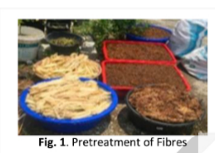
Fig. 1. Pretreatment of Fibres