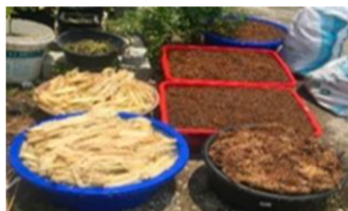
Fig. 1. Pretreatment of Fibres

Your published work in the Journal of Advanced Research in Fluid Mechanics and Thermal Sciences , volume 99, no. 1.,