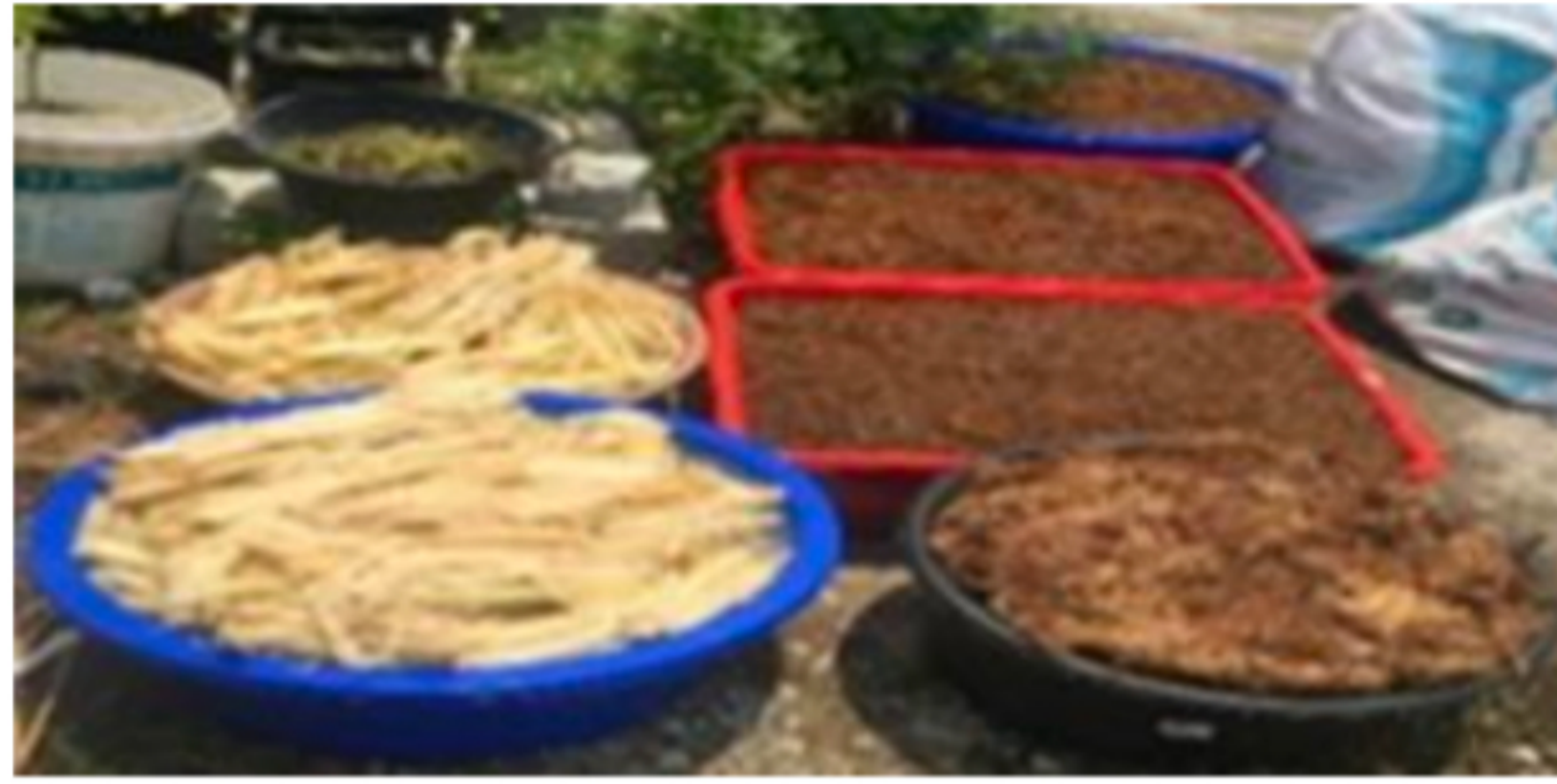
Fig. 1. Pretreatment of Fibres