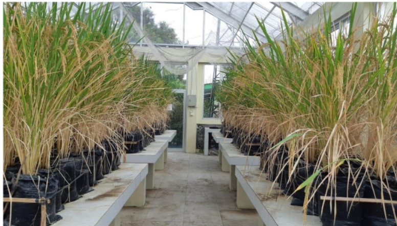
Figure 1. Photo of rice crops with Allium extract application at 105 DAP

The experiment culture of rice crops with Allium extract application at 105 DAP can be seen in Figure 1.