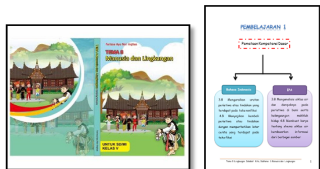
Fig. 2. Early Designs of Pocket Book Based: on Local Genius

At this stage, the authors prepared all the components that will be displayed in the pocket book that will be developed including: designing learning activities, designing materials, designing learning evaluations and designing structures and covers (Figure 2). At this stage, one thing that must be considered is the use of fonts in teaching materials. Font is a complete collection of letters, numbers, symbols, or characters