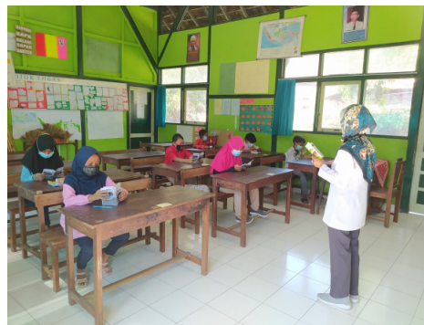
Fig. 4: The Using of Pocket Book at Fifth Grade, Gamping Elementary School

In this implementation stage, the examiner conducted a limited trial with a sample of 7 fifth grade students at Gamping Elementary School (Figure 4). In this study, data were obtained in the form of teacher responses, student responses, and the results of the pretest and posttest scores of fifth grade students in the learning process using a pocket book based on local genius. In this study, the results of the student response and questionnaire were conducted to determine student responses to the development and learning process using a pocket book based on local genius. The results of this teacher's response were carried out with the aim of knowing the teacher's response to the learning process using pocket book teaching materials based on local genius. The results of the observation of the implementation of the learning process using a pocket book based on local genius aims to determine the teacher's delivery,