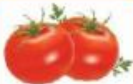
Tomato - Tomat