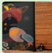
Picture 5.6 Graffiti is art.

Second, graffiti has the power to affect people positively. The people who create it are expressing themselves. They are expressing their artistic abilities and their voices through a canvas. Their voices are the voices of our future. You can