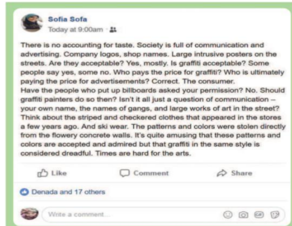
Figure 3. Social Media Status 2

This reading text shows the communication practice through social media. It reflects different point of view on graffiti which cause disagreement. By this reading text, it reflects many people who ignore graffiti and the writer provides balanced views related to society group that against for graffiti and those who support it. In this reading text, both graffiti and advertisement media require space and price to pay which is carried by themselves and not people in society. Besides, both of them provide their own benefits for people. By this reading text, the author wants students to consider and cultivate multiple perspectives in order to be wiser and avoid disagreement on an issue in society.