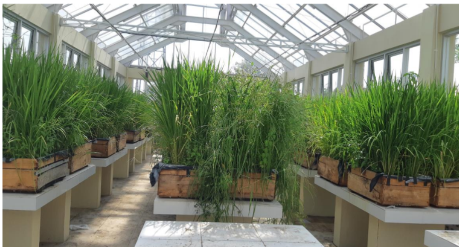
Figure 2. Photo of the experimental culture at 60 DAP

The same works were done for all weed species that grew in all sample plots. Each weed species from each treatment was entered in paper bags and was dried for one week in the solar thermal. All treatments were done in the same way. Each weed species in the paper bag was dried in a Binder drying oven ED series for 48 hours at 80 °C or until the dry weight was constant. The weed dry weight was calculated according to the species, while weed dry weight was calculated from all weed species in one wooden box. Weed dry weight was measured using the ACIS AD-i Series digital analytical balance.