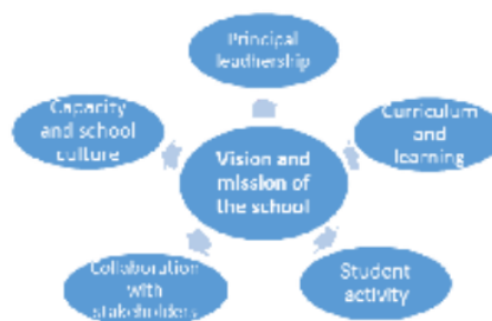
Figure 1: Humanist Learning Implementation Model.

When described as a whole, the humanist learning model in strengthening character education at SMP Negeri 1 Jetis Bantul is in line with the “Whole Schools” model. The model is described in the following figure.