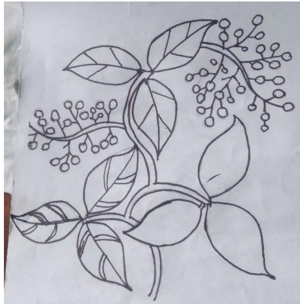
Figure 2. Student design Batik with leaves patterns.

In addition, the motifs drawn by students in the co-curricular activities of learning Batik are taken from the natural environment in the form of flowers, as indicated in Figure 2.