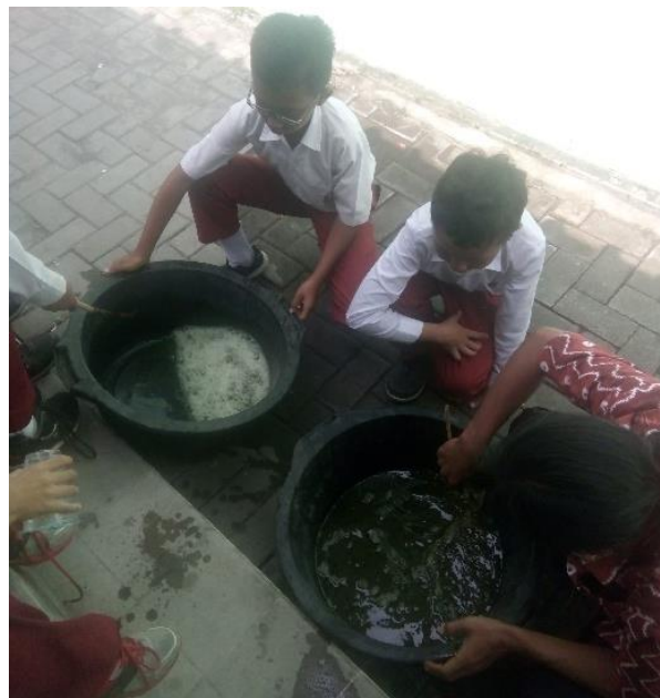
Figure 3. Students with teacher do the basic color dyeing.

Interfering factors for the co-curricular program of learning Batik could be viewed such as limited facilities, time duration, teaching approach and a less conducive environment. The number of obstacles in co-curricular activities can still be found even as an explicit norm mainly in terms of technical issues, such as the guideline of practicing on writing the Batik pattern [49]. Moreover, there were challenges such as unconducive circumstance among the students in following the instruction given by the teachers. At this point, the teachers would consequently be open and responsive to all their students in allowing them to conduct the writing activities of Batik pattern from the beginning to the end. This is as indicated on the Figure 3.