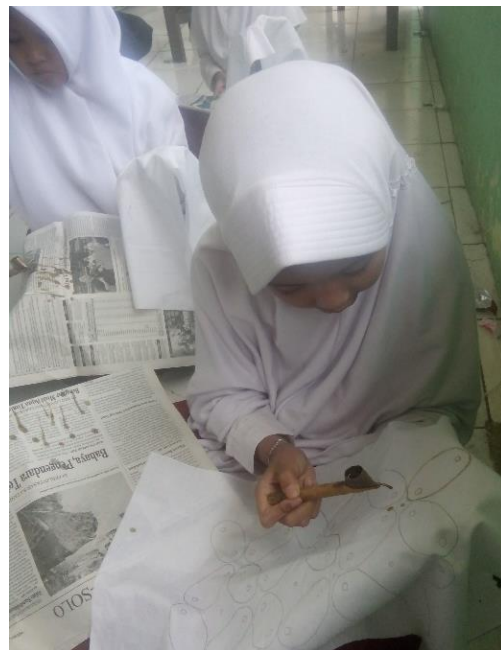
Figure 4. Student tracing Batik patterns on cloth.

In line with advancing the co-curricular learning program of Batik in order to enhance the main significance of this activity, the way of making the learning impact for being more visible and open requires the knowledge comprehension with consistency as this would give feedback to manage the commitment and discipline in the practice of learning Batik [57]. As this program might give a substantial value in broadening the vision into the real impact, the extent of co-curricular activities could be further managed in a proper manner through developing the learners' reflective way towards the learning of Batik practice, as indicated in Figure 4.