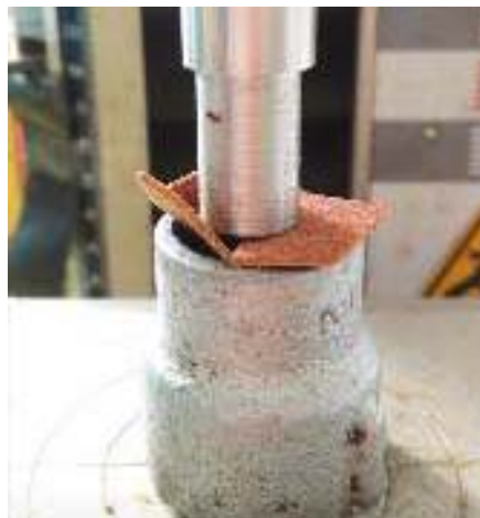
Figure 2. Tortilla texture analysis with Universal Testing Machine (UTM)

The fiber content in the tortilla ingredients also affects the crunchiness of the tortilla chips. Fiber is a polysaccharide found in food and has a function as a texture enhancer. The higher the fiber content in a food product, the stronger the resulting texture. If the texture of the chip product is getting stronger, the resulting texture of the chips will be harder and will have high fracture power. A chip product has good quality if it has low fracture power, resulting in crispy [21]. This is consistent with the results of research where the higher the concentration of vegetable flour was added, the higher the F_{break} value or the breaking strength of the tortilla so that the texture was getting harder. Fresh red spinach has a fiber content of 5.9-9.1% and when used as flour it is 9.45% while beetroot is 1.9-2.1% [22]–[24].