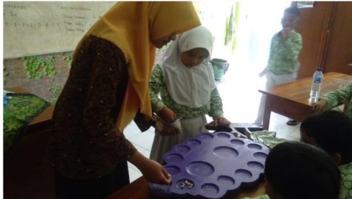
Figure 2. The use of Dakon media in the learning process in class.

below is a verification of the use of Dakon media in the teaching and learning process in the classroom in improving the ability to solve problems and interest in learning mathematics.