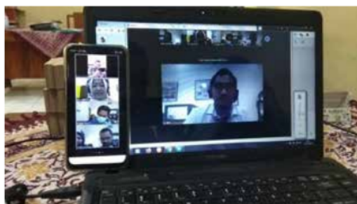
Figure 2. One of English Training Activities for teachers in Rejodadi Elementary School during Pandemic Covid-19 on 14 th May 2020

The online teaching and learning activities by the elementary teachers are the moment to gain and collect data as the sources to design scientific research in form of Classroom Action Research or for scientific publication. They do have preparation to design the scientific ones [7] since their time of teacher training. The matter is only on reminding or refreshing them on the knowledge and skill to design scientific research, it can be through the training or workshop. Training, workshop and guidance are proven able to overcome teachers' problems on designing scientific research paper [5][2][9][4][12][16][17] and designing the classromm action research [3][18][8][19][20][21]. The intensive guidance is urgently needed to maintain the motivation to write. The role of universities, especially the institute for Teacher Training as the school and teachers partner is needed to develop the quality of the teachers. The developing qualities of the elementary teachers will positively impact to the elementary education in Indonesia.