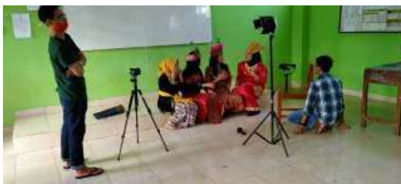
Figure 2. Making process of instructional video

The inculcation of character values outside of learning in junior high school is carried out by the school, namely smiling, greeting, greeting every time students meet the teacher, reading the holy books of each religion on certain days, singing songs Indonesia Raya, completes a personality questionnaire every day and will report it to the parents of students, assessing the attitudes and behaviour of their own friends to be material for self-reflection of the students concerned and others. Therefore, in order to develop a learning model, a teacher must be able to adjust the model he chooses to the student's condition, material, learning, and existing facilities. Therefore, the teacher must master several types of learning models so that the teaching and learning process must run smoothly and the goals to be achieved are quickly realized.