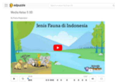
Figure 2. Product Design to be Developed

At stage this researcher To do planning for IT-based media products in the form of Edpuzzle , thematic social sciences loading who will develop. Edpuzzle is a simple product that does one thing well but opens up a lot of possibilities for the user. Edpuzzle is probably the easiest way to create interactive video lessons. It is an e-learning platform that allows users to edit and add questions to any YouTube video. Users can also create their videos and then use Edpuzzle , to make them interactive [15]. Compilation planning study covers the determination of the goal to be achieved in every stage, design, and step development in research. The result of Step planning that is the researcher gets a picture and designs the product to be developed in research (Figure 2).