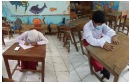
Figure 5. Implementation of Limited Test by 5 Students

Trial activities limited this done for know power pull student to products that have been generated. Trial limited done student by offline 5th on Wednesday, December 29, 2021, in class V SD Rejodadi Bantul, Yogyakarta (Figure 5).