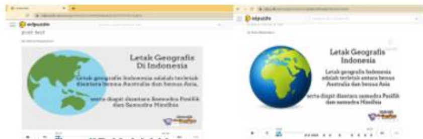
Figure 6. Media results before fixed ( left ) and after repair