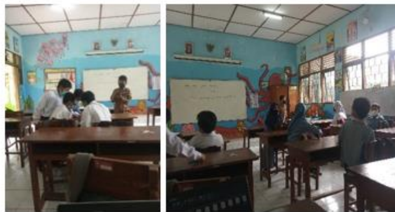
Figure 7 Field Test Implementation

Trial field was done offline on Tuesday, January 11, 2022, in class V SD Rejodadi Bantul, Yogyakarta to 28 students (Figure 7).