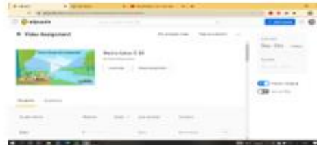
Figure 4. Plan of Final Product