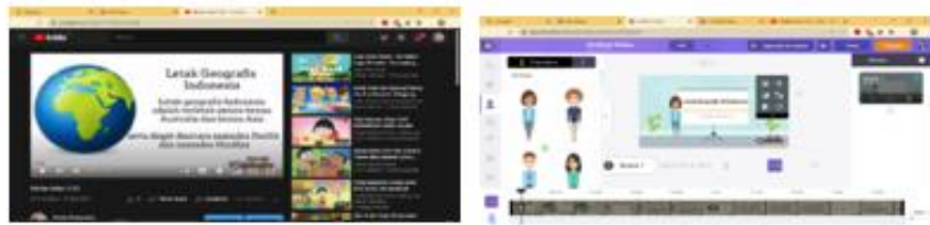
Figure 3. Design