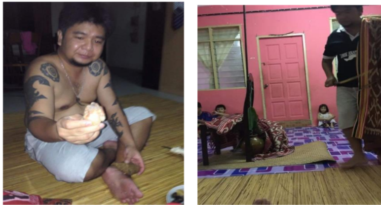
Figure 1: Manang Or Shaman With His Pengaruh Or Equipment To Perform The Pelian.

Located According To Its Category. The Sebayan Or Dead Community Is Having Their Own Leaders, Like Raja Niram Lenggah Lenggah, Dara Rambai Geruda And Indai Bilai. Therefore, That Is The Reason In Every Death Ceremony, The Tukang Sabak Or Chanter Performs Sabak Bebuah. The Tukang Sabak Or Chanter's Spirit Or Soul Will Go Together With Sebayan Or Dead Spirit To Guide The Deceased's Spirit To Sebayan Or The World Of Dead. Similarly, In The Ritual Pelian, Manang, Or Shaman's Spirit Will Go To Sebayan Or The World Of Dead To Seek The Patient's Spirit Or Soul And Require Assistance From Other Sebayan To Get Back The Patient's Soul Or Spirit To This World.