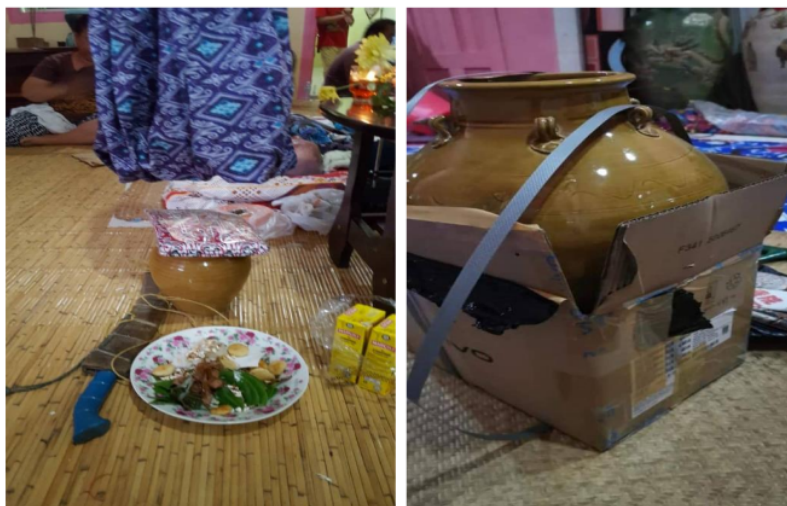
Figure 3: Piring (Offer To God And Soul Of The Dead), Knife (To Strengthen)