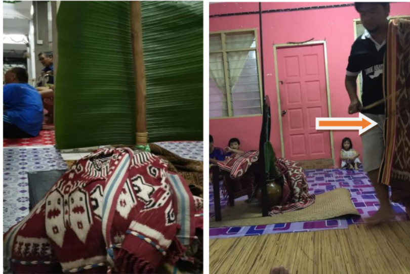
Figure 2: Pagar Api (Centre Of Pelian Process) And Pua Kumbu' (Cover To Manang's Soul)

Or Centre Point Of Pelian, Kain Sarung, And Kain Bedepa. Pua Kumbu' Is Required As A Hidden Place For The Spirits Of Manang Or Shaman From Sebayan (The Dead) And Antu Jai Or Evils. The Piring Or Offering Is Prepared As A Gift To The Petara Or God, And Sebayan Or The Dead Invited To The Pelian Ceremony. The Knife Plays The Role To Strengthen The Spirits Of Manang Or The Shaman In Enabling Him To Work With Sebayan (The Dead) And All Petara (God) Who Are Present In The Ritual. Without Strengthening The Power, The Manang May Alah Ayu Or The Life Force Of Manang Will Become Weak And Fall Sick. Anak Kebuk Or Small Jar Acts As A Place For Manang Or Shaman To Hide Him And The Patient's Soul Or Spirit, Including Their Whole Family. Pagar Api Acts As A Centre Point Of Pelian Process Where All The Equipments Are Kept During The Pelian Process. The Kain Berdepa (Cloth) Also Functions As A Protector To Manang Or Shaman's Soul And Later Will Be Given To Manang As A Gift.