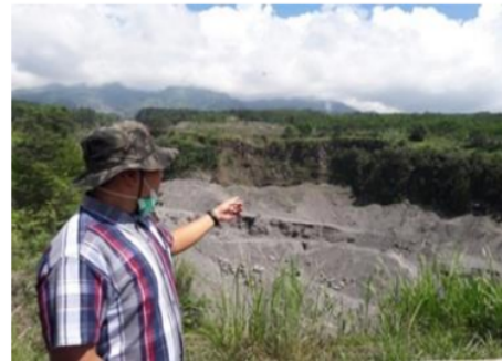
Figure 4. Parennial Sand Dunes in Desa Petung, Cangkringan

Local material availability in Cangkringan can fulfill the need of material for local society. This eruption materials then collected by society then they make it as block, mortar, and materials for plaster floor. Many of local material like big rock, small rock and sand are from Merapi eruption, collected by society as local material business whether in the raw form or mature form, like block, roaster and etc (Permana, 2017).