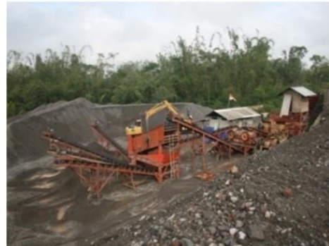
Figure 3. The Rocks Minning Place as Raw Material of Block Making in Umbulharjo, Cangkringan

Tour and as lobar of sand and rocks minning in dry season (Pyles, 2011).