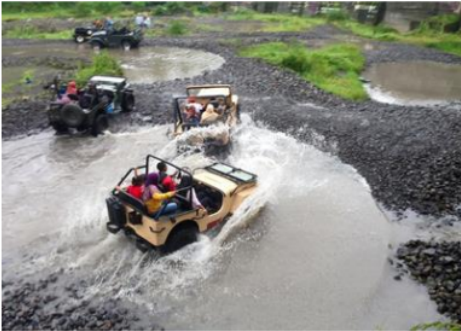
Figure 5. Business of Jeep Lava Tour Turism

Beside they becomes sand and rocks manner, they also become bredeer, especially dairy cow and beef cattle. Then, they also sale the milk that collected by local village cooperative (KUD) with price Rp. 2000,- per liter. In one day they can supply two times with the average in each supply is 5-10 liter per (Pyles, 2011; Sajogya, 1977; Setyowati, 2014).