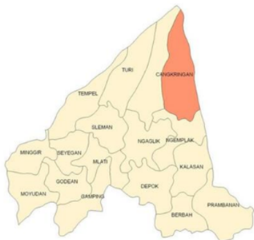
Figure 1. Cangkringan Area Map

Cangkringan is district in Sleman regency of Yogyakarta. Cangkringan area has its attractiveness because it's place that drained with bigs rivers that produce many sand and rocks like Opak, Gendol, and Kuning rivers. Sand and rock in Cangkringan is from material of Merapi eruption so until nowadays society has perception that Merapi eruption is a gift and not a threat. Geographic location of Cangkringan that has potential to produce sand and rocks so this area can develop as Industrial area (Permana, 2016; Permana, 2017; Eickelman, 1978; Glenn, 2013).